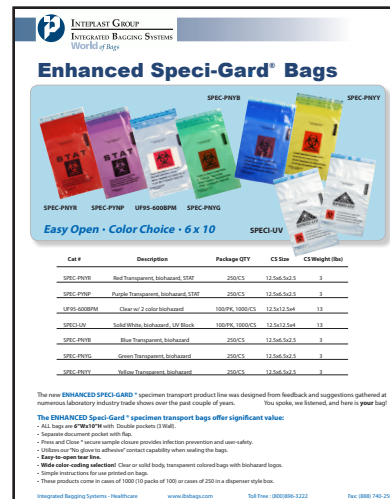
#2. ENHANCED SPECI-GARD KIT