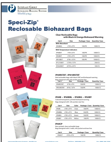
#3. SPECIZIP KIT